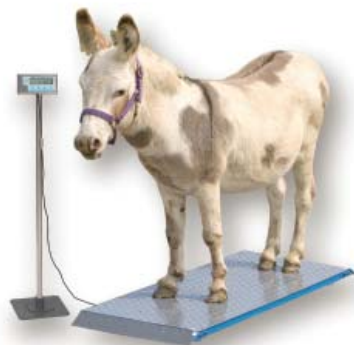
Shown with optional indicator stand

Easy Assembly – No installation costs or parts that require maintenance. Just place the scale on a hard surface and level by adjusting the foot pads. Connect the indicator and turn on the power.