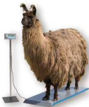
Shown with optional indicator stand