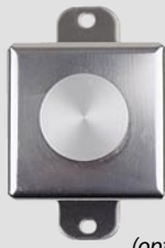
(optional*) Mountable Pushbutton